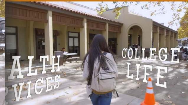
Images from Campus Video Tour