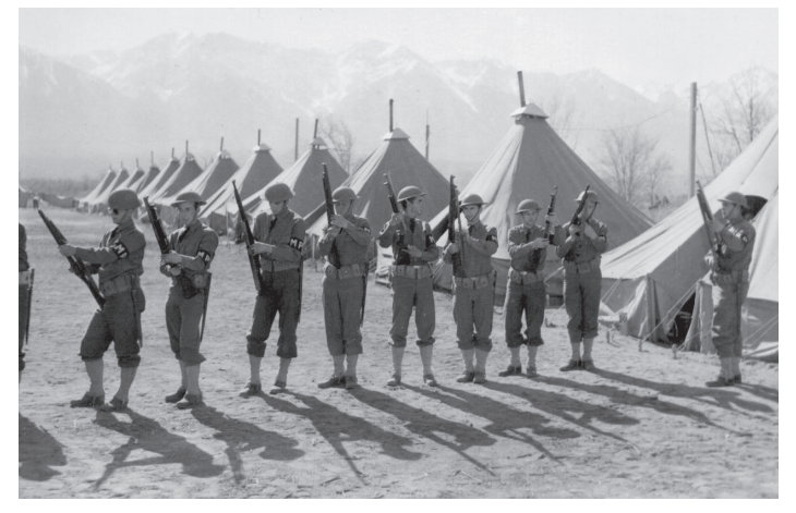
MPs at Santa Anita Assembly Center, 1942.