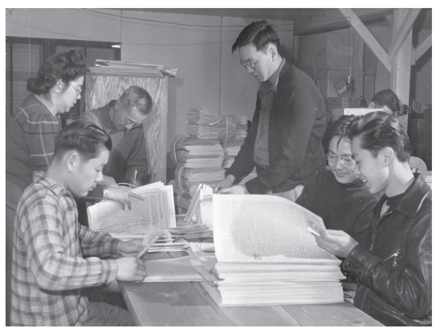
Assembling and folding the Heart Mountain Sentinel, 1943.

1,800 Nisei and 500 aliens eligible, only thirty-eight volunteered, with half failing their physicals.<sup>30</sup> Faced with failure, the Army and the WRA had to re-evaluate their approach and next embarked on a segregation program aimed at isolating "disloyals" into the Tule Lake Camp near the California-Oregon border. Using the information gathered by the questionnaire, the Army began to separate the "loyals" (those who answered "yes, yes" to both questions 27 and 28) from the "disloyals" (those who answered "no, no"), and by September 1943, 903 internees deemed "disloyal" were shipped from Heart Mountain to Tule Lake.<sup>31</sup> Mits felt that during this period things were at a lull: "The excitement had died down and the Nisei were feeling bitter." He doesn't remember much about the segregation policy, but does say that: "I was not a 'no, no' and made it clear that I would serve in the Army if they gave me back my rights."