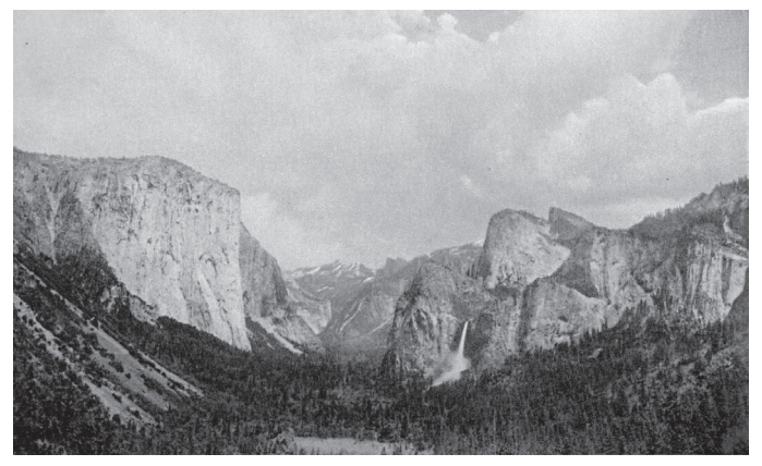
Yosemite Valley from Artists' Point.

Lectures: Wednesdays, April 22 & 29, 2009 6:20 to 10:00 p.m., CHC Field Trips: Saturday, May 2 & Friday, May 15 (TBA)