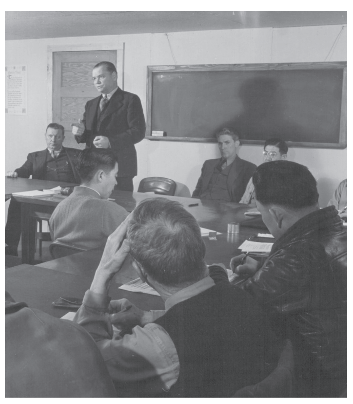
Government official addresses internees about Selective Service procedures at Heart Mountain, 1944.